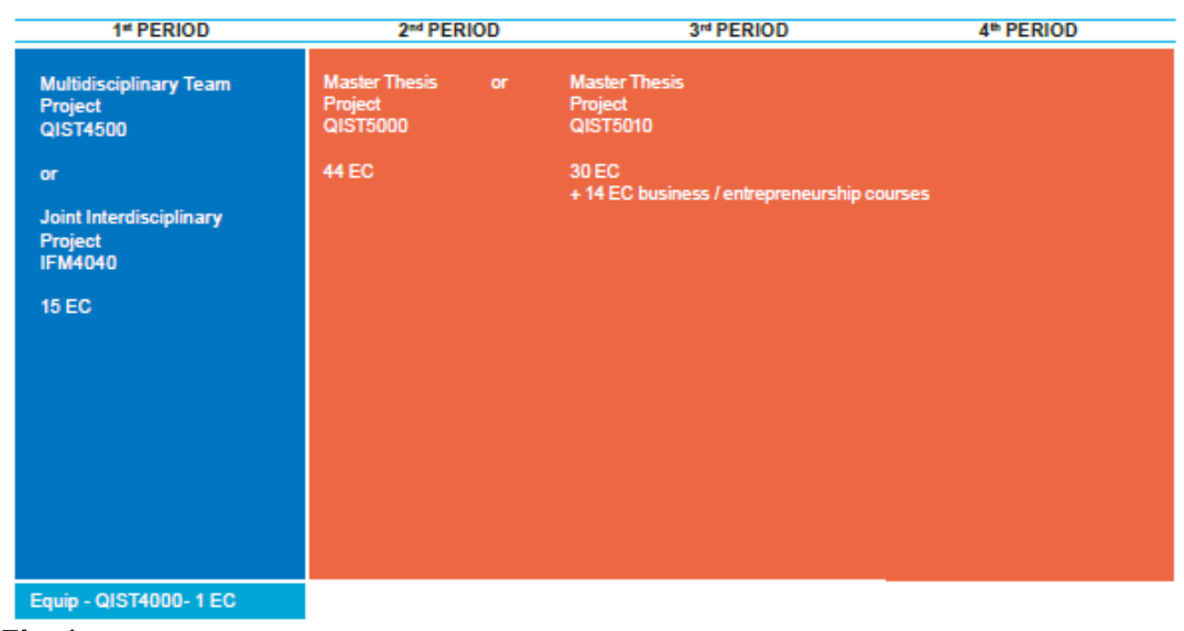
Fig. 1: Outline of the curriculum, with each of the two years split into four quarters (Q1-Q4).